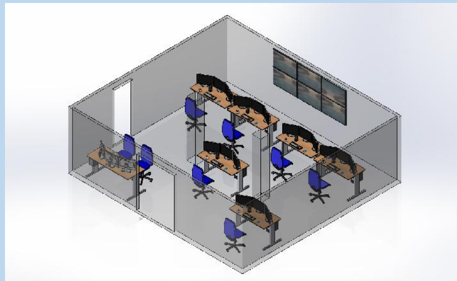
OPS Room, example