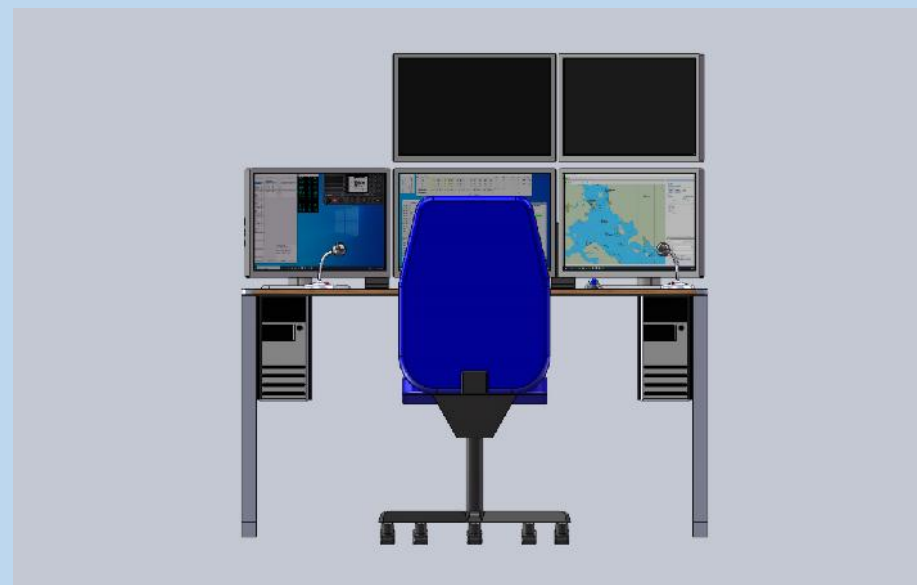
Instructor / Planning station