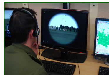
Sitaware and IFACTS