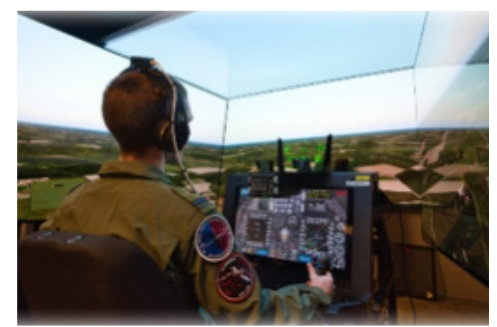
All pictures courtesy of the Royal Danish Air Force (RDAF